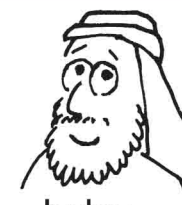
Judas (son of James)